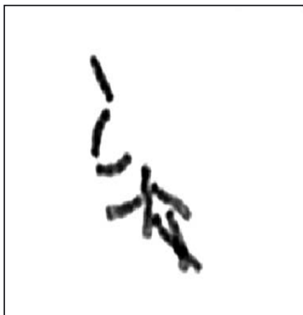
Fig. 3. Mitotic metaphase plate of Leontodon tuberosus .