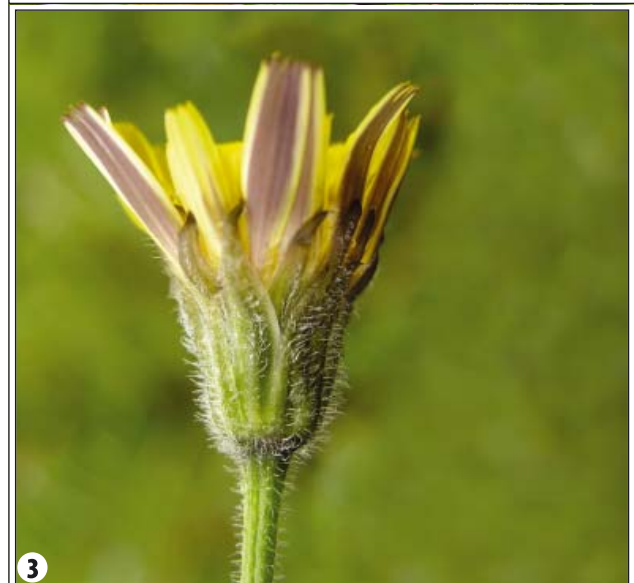
Fig. 1. Leontodon tuberosus : 1, whole plant; 2, leaves; 3, flower head.