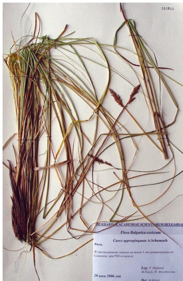
Fig. 1. Carex appropinquata – herbarium specimen.

ta , which has entire basal sheets, C. appropinquata has black-brown shags formed by lengthwise disintegrated hair-like basal sheaths. It has narrower leaves (1–3 mm wide) and very short side branches of the panicle. It also has opaque venous fruits and ferruginous glumes without scarious margins, while the utricles of C. paniculata are slightly veined.