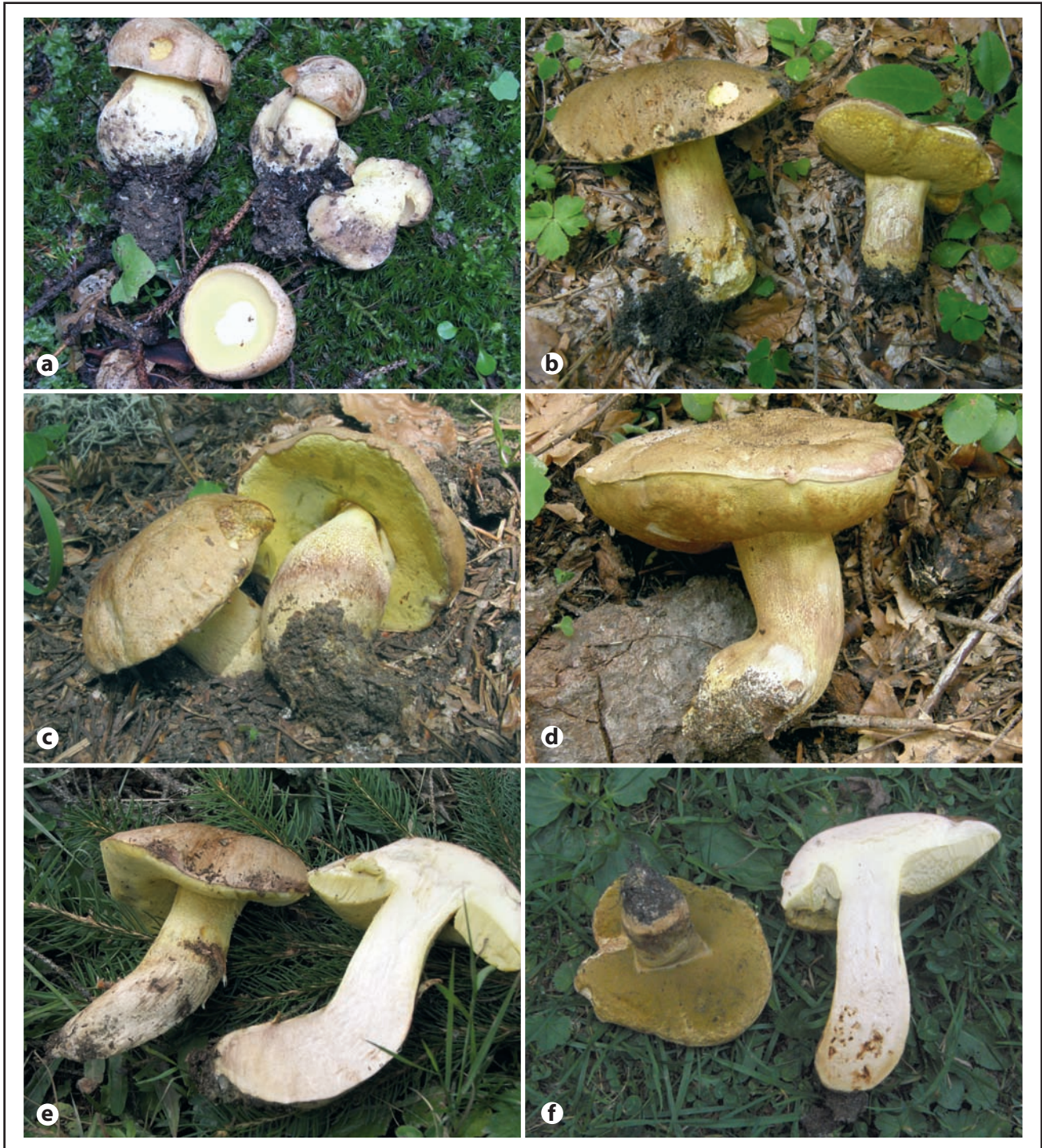
Fig. 1. Basidiomata of Boletus subappendiculatus at different stages of development in situ.

Pileus up to 8 cm in diameter, initially hemispherical, subsequently convex to flat-convex, seldom flat or slightly depressed, dry or occasionally slightly viscid when old, smooth, fibrillose or finely cracked, brownish-orange, sunburn, cinnamon, light-brown (5C3-4, 6D4-5, 7D4-6), buff or clay buff (BFF 32, 52); surface