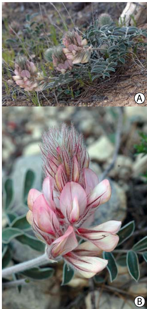
Fig. 1. Hedysarum grandiflorum subsp. bulgaricum in its natural habitat. A: Plant in flower, growing in an opening of Pinus halepensis woodland. B: Detail of the inflorescence.

Perennial plant, acaulescent or with short stems up to 4(–8) cm covered with a few remnants of old petioles and stipules, forming a single or a few rosettes of leaves. Stipules membranous, triangular to quadrangular, often bifid, connate and sheathing stem and petioles, sericeous, 7–11 mm long. Leaves 6–15 cm long, imparipinnate, with 3–5 pairs of leaflets; leaflets 8–21 × 6–17 mm, ovate to oblong-elliptic, with sparse silvery hairs, particularly along the midrib and margins on upper surface, and dense, silvery, ad-