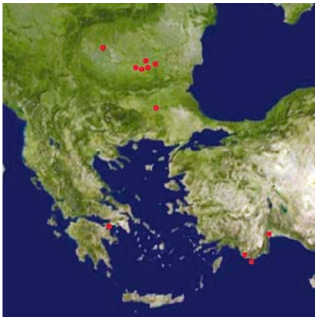
Fig. 2. Distribution map of Hedysarum grandiflorum subsp. bulgaricum in Bulgaria and Greece (red circles), and Biarum ditschianum in Turkey and Greece (red squares).

The Greek population of Hedysarum grandiflorum was first discovered in fruit, during a visit to Mt. Gerania (Southeast Sterea Ellas) in 2008 (see map of Fig. 2). Flowering material was collected in 2009 and the label details are as follows: