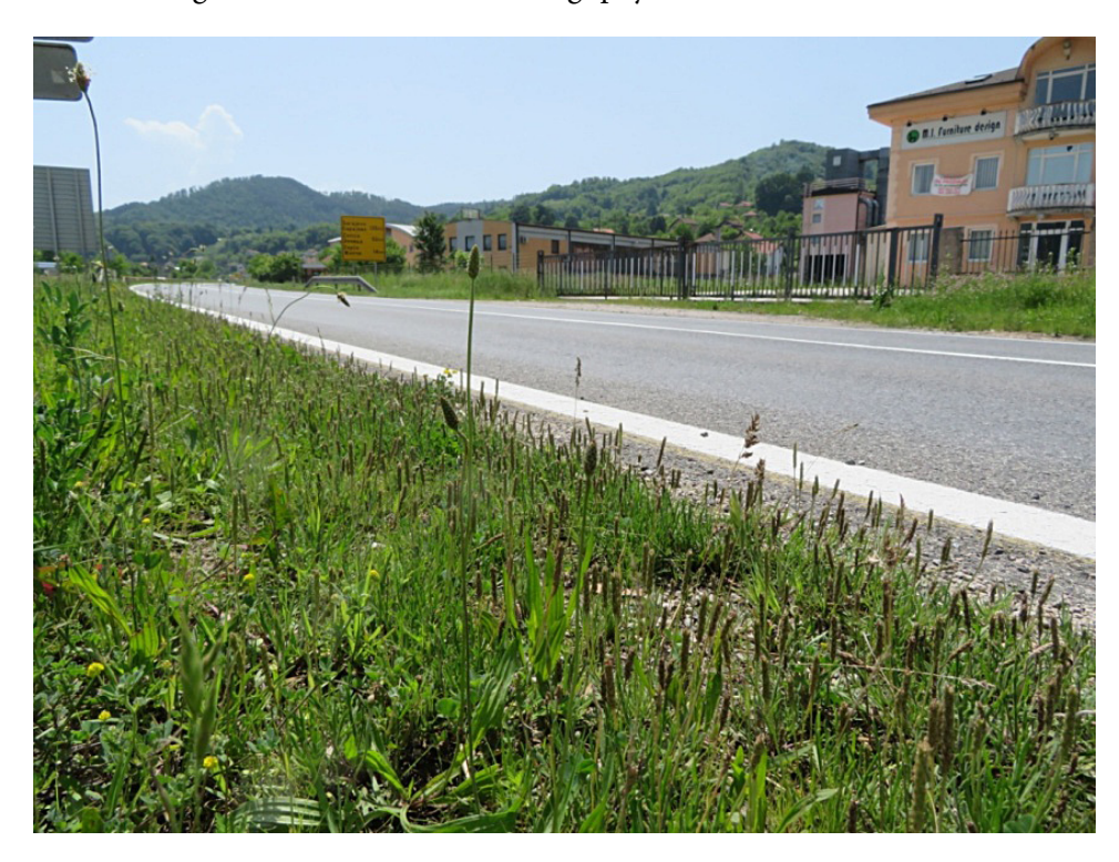
Fig. 2. Habitat of Plantago coronopus in Maglaj.

nological relevé was outlined in Maglaj (D. Schmidt, 08.08.2019, relevé size: 2 × 0.5 m, cover in percentage): Plantago coronopus 50, Ambrosia artemisiifolia 10, Medicago lupulina 3, Medicago × varia 2, Plantago lanceolata 2, Cichorium intybus 0.5, Trifolium dubium 0.5, Bromus hordeaceus 0.3, Taraxacum sect. Ruderale 0.2, Pimpinella saxifraga 0.2, Arenaria serpyllifolia 0.1, Lotus corniculatus 0.1, Cerastium pumilum 0.1.