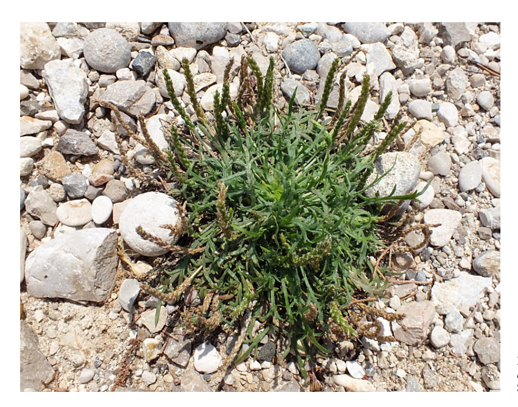
Fig. 3. Habitat of Plantago coronopus in Mostar (Photo: Semir Maslo).

The first record of this species in Bosnia and Herzegovina was from the lower part of the Neretva Valley, above Dretelj, where it was found on a sandy embankment by Karl Maly in 1912. The voucher specimen was deposited in the Herbarium of the State Museum in Sarajevo (SARA, inventory number: 38098). The new occurrences in the Neretva Valley were linked to the old finding of Maly. However, the difference was that the new stands were observed in an anthropogenic habitat.