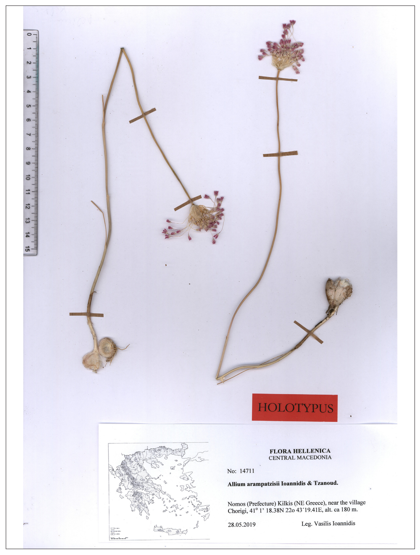
Fig. 2. Holotype of Allium arampatzisii Ioannidis & Tzanoud., Ioannidis 14711 (UPA).