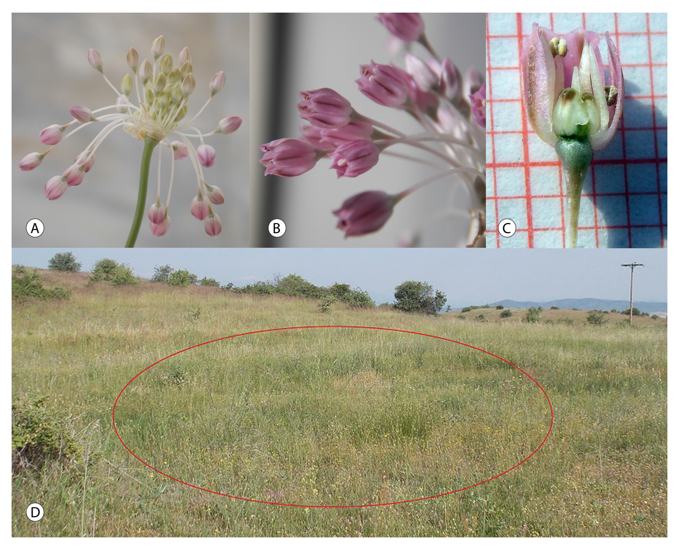
Fig. 1. Allium arampatzisii: A - inflorescence; B - shape and color of flowers; C - size and inside view of the perianth; D - habitat.

Diagnosis. Allium arampatzisii, a spring-flowering species of the Greek flora, is characterized by spathe and spathe-valves shorter than umbel, stamens included in the perianth and ovary with distinct nectariferous pores, and belongs to the group of species of Allium. subgen. Allium, which were gathered in A. sect. Pseudoscorodon Brullo & al. (2019). With its lax and multi-flowered inflorescence, unequal and flexuous pedicels and small flowers (ca. 3.5 mm) it